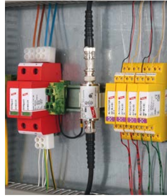
Solution with individual components