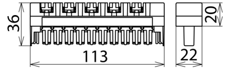
Dimension drawing BM 10 DRL

Plug-in SPD block (without SPDs) for 1 to max. 10 three-pole GDT 230 B3 ... gas discharge tubes. Also suitable for DRL protective plugs with earthing frame.